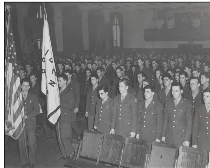
Graduation, January 28, 1944, Army Specialist Training Program collection, Providence College Archives and Special Collections

In 1982, Bryant College (now Bryant University) was added to the Patriot Battalion and in 1983 the following were included: Brown University, Johnson and Wales University, University of Massachusetts at Dartmouth, Rhode Island College, Community College of RI and Bristol Community College. Throughout its history, the ROTC program at Providence College has been continually recognized as one of the top programs in the New England and New York area. To date 2,035 officers have been commissioned through the Providence College Program.